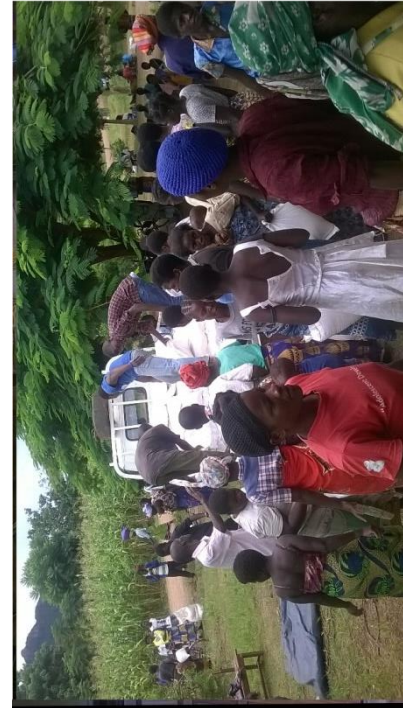
Chuluchosema Food Distribution, March 2nd

Top left - some of the bags of maize waiting for collection at the clinic